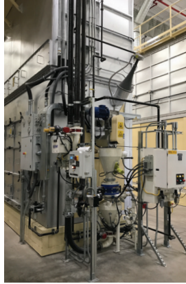
Material handling mill conveyor

We won't provide a status quo solution to your material handling needs. Or take the "it's good enough" approach. We don't believe that yesterday's answers address today's unique challenges in battery production. Rather, we constantly bring forward new and better ways of handling and mixing materials, especially hazardous products like lead oxide. Our precise controls system and instrumentation better manage your inventory, assuring safer, cleaner and more accurate conveyance. Deliver a higher quality finished product and save time, labor and material with Cyclonaire.