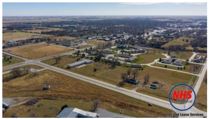
335 W 25th -210