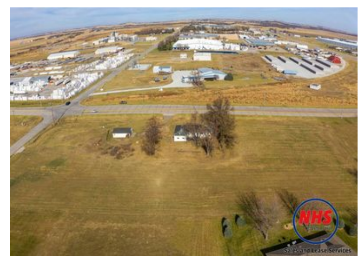
335 W 25th