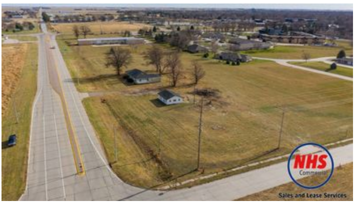
335 W 25th -200