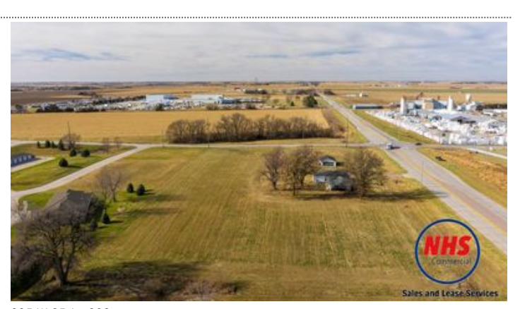
335 W 25th -208