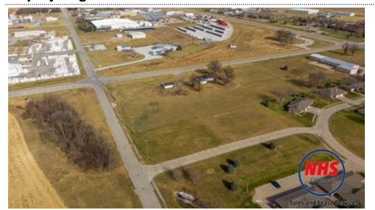
335 W 25th -204